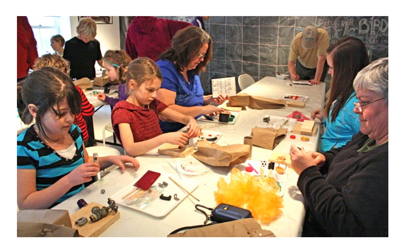
"When you make things it's good for your brain!" ArtLab participant, age 8

In the fall of 2011, with an initial grant of $5,000 from the Milton & Sally Avery Arts Foundation, the Center for Maine Contemporary Art launched a new arts education program called ArtLab for All Ages . The concept was simple, provide a space stocked with supplies for a creative arts project and invite people of all ages to drop in once a month on a Saturday afternoon to make art together. There would be no parent and child requirement, no fee, and no registration in advance. It would be open to all, without barriers .